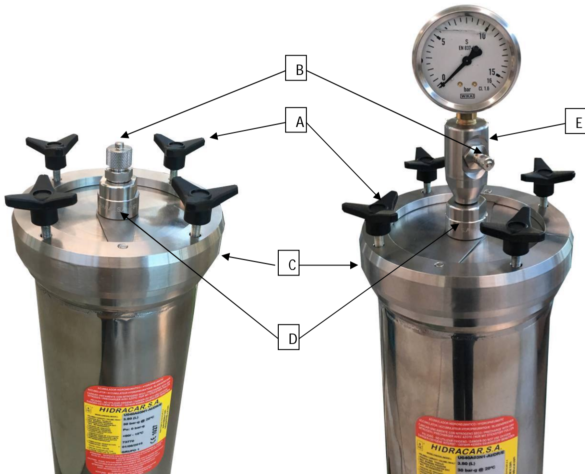
Pulsation damper mounted with gas charging valve

HIDRACAR PRODUCT REFERENCE: U###X##X#-AI/DR/ALIM